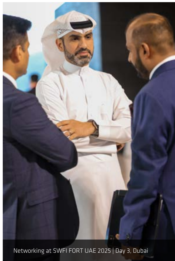
Networking at SWFI FORT UAE 2025 | Day 3, Dubai