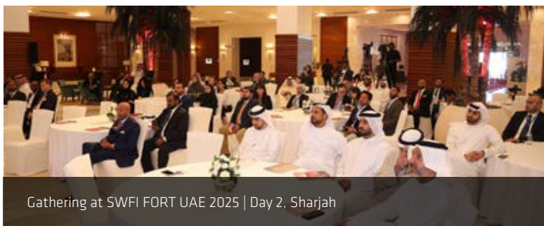
Gathering at SWFI FORT UAE 2025 | Day 2, Sharjah