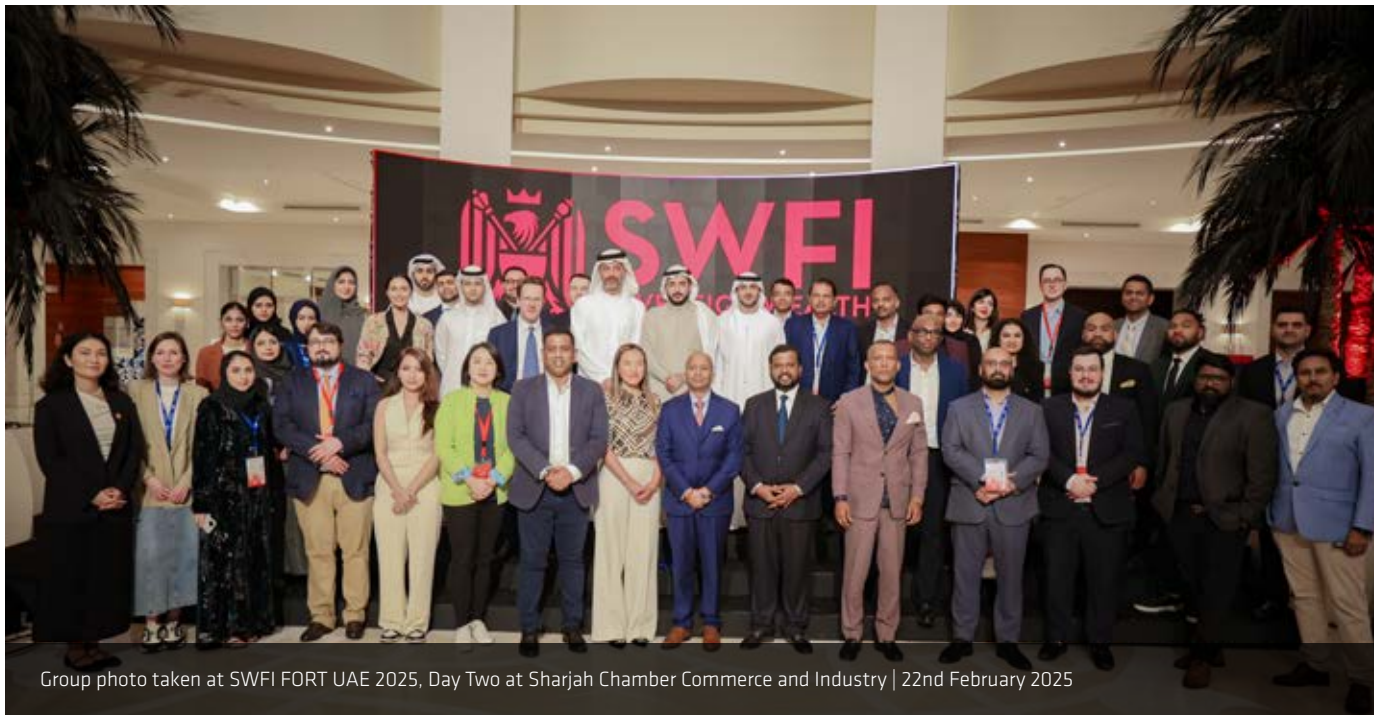
Group photo taken at SWFI FORT UAE 2025, Day Two at Sharjah Chamber Commerce and Industry | 22nd February 2025