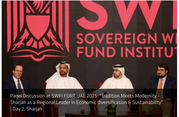
Panel Discussion at SWFI FORT UAE 2025: "Tradition Meets Modernity - Sharjah as a Regional Leader in Economic diversification & Sustainability" | Day 2, Sharjah