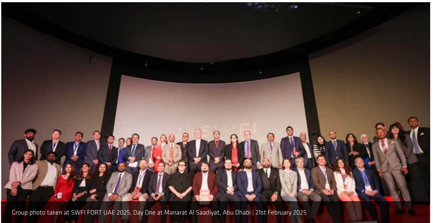
Group photo taken at SWFI FORT UAE 2025, Day One at Manarat Al Saadiyat, Abu Dhabi | 21st February 2025